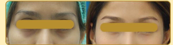
LipoFill tear trough

Patients are up and around immediately following fat injections. Any discomfort following the procedure can be controlled with medication. Some swelling at the treatment site may last up to weeks. There may be some bruising, which can be covered with make-up. Your initial injection should last up to six months. Over the first few months about 20-40% of the fat will be absorbed by your body. The remaining will usually stay in place for years. You can come back to retouch anytime.